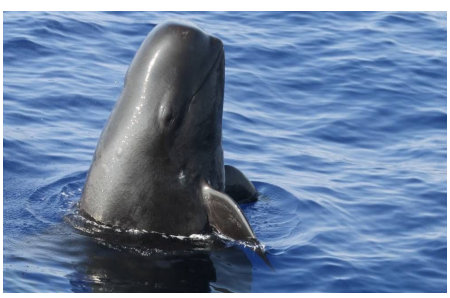
Marine Mammal: Short-Finned Pilot whale Scientific Name:

2. What are 5 examples of marine mammals you can see on a whale watching cruise in California?